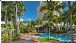
All Forum Attendees and Guests

What are the big questions that keep you up at night?